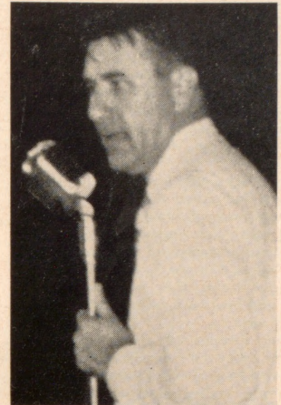
EVANGELIST ORAL ROBERTS And Full Gospel Business Men Will Speak At

Oral Roberts CLOSING MEETING Sun., Oct. 11 Afternoon